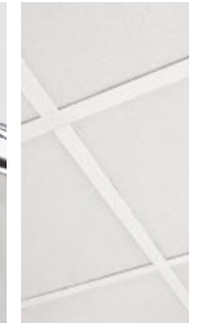
Suspended Ceiling Grid