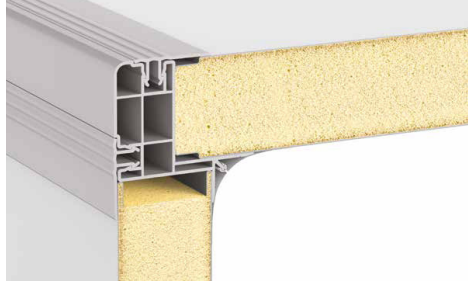
Glasbord® with Surfaseal® Modular Panels (Hygicold)