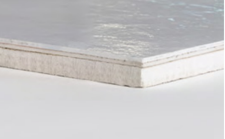
Glasbord® with Surfaseal® laminated on Rigid Board (Hygimat)